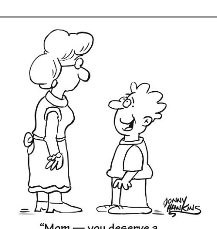
"Mom — you deserve a raise for raising me."