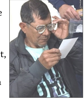
The life-changing gift of eyeglasses

Vista Missions would not be able to operate their clinics without the donation of used eyeglasses from people like you. They collect, clean, and sort these glasses for upcoming mission trips. You can make a difference by donating your used eyeglasses—simply drop them in the donation box in