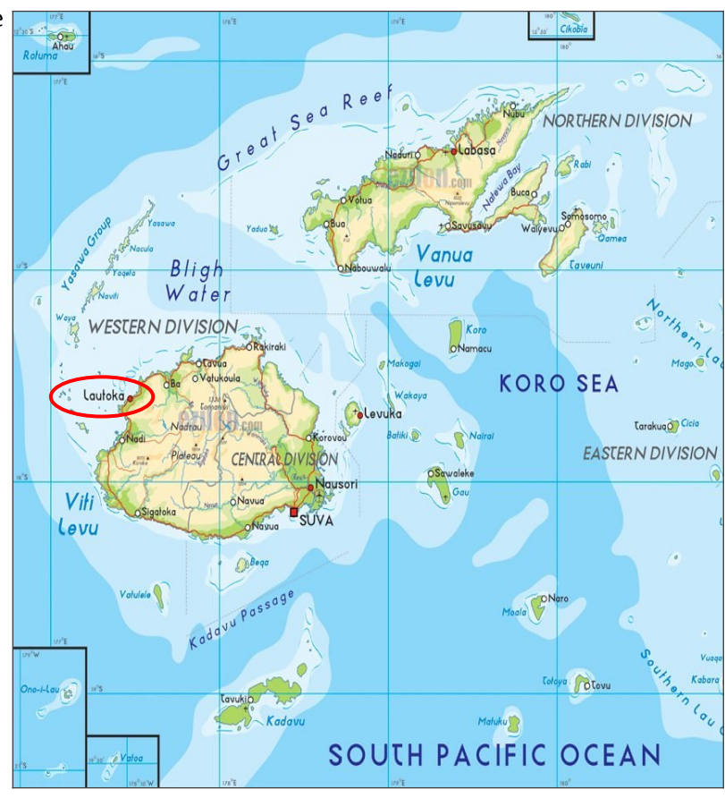
Map of the Fijian Islands. Lautoka is circled in red.

He sums up his philosophy of ministry this way: "Here at CTEF and among Bible Churches, our desire for everyone is that they may learn sooner how it is only when under the exclusive ownership of God, can we give our Master unquestioning obedience . Like a dispensing chemist who makes up a medical prescription prescribed by a doctor, the requirement is to do the job as instructed , and not to try to make self-devised "improvements" of one's own. Hence, does man indisputably consider us as servants of Christ ?" May we all be so found by those who observe us.