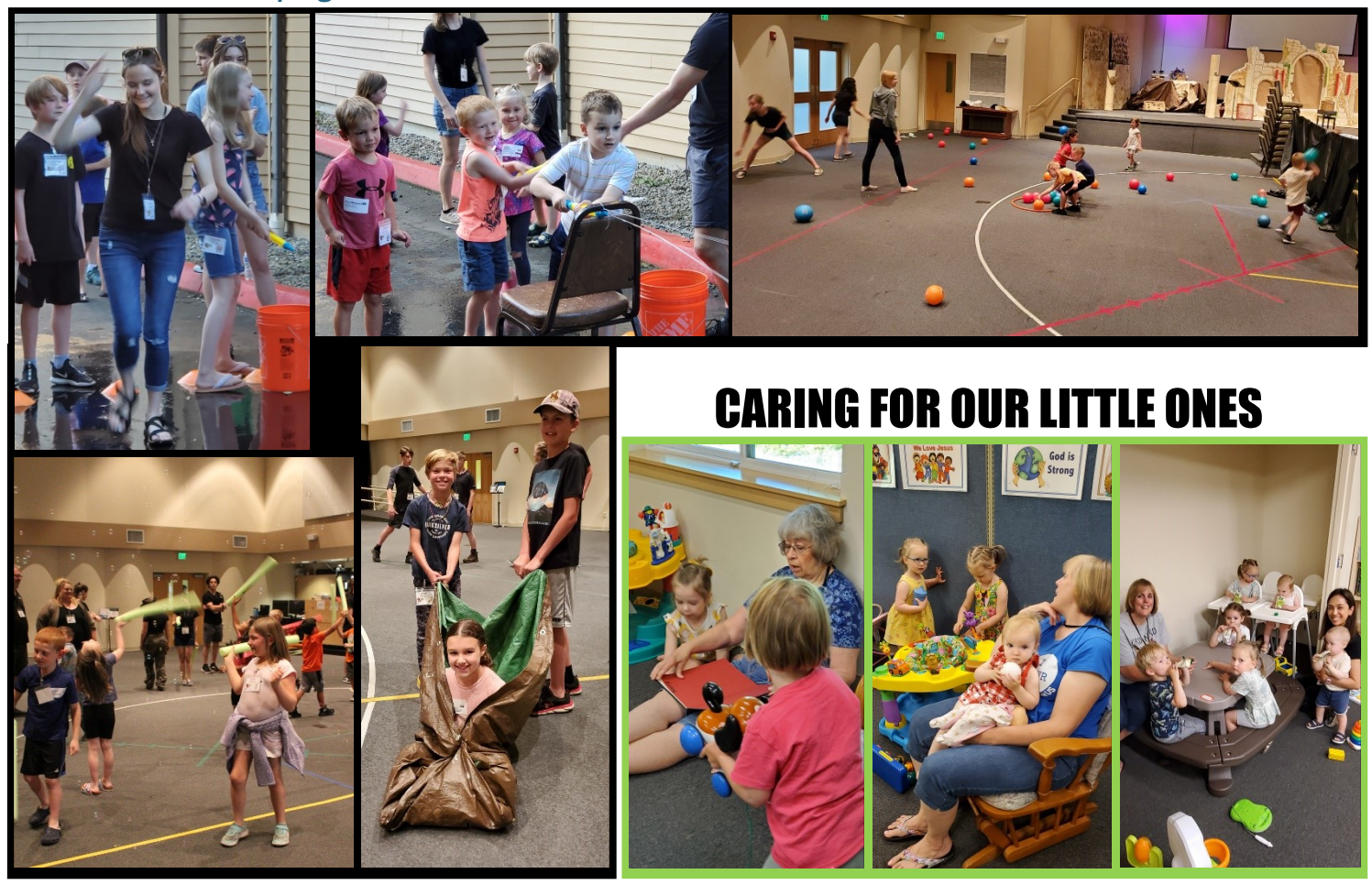
More VBS photos on pp. 7, 8