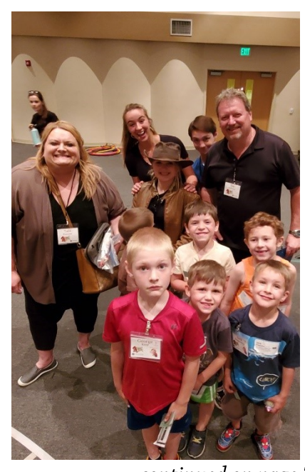
continued on page 2

and gave us the opportunity to teach the Bible to them. May the Lord bless you all! We look forward to seeing you at VBS next year!