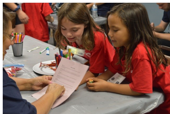
More photos on page 8

them. I would like to encourage every parent to continue to help your children practice those memory verses (Proverbs 3:5-7; Hebrews 10:23; 11:1) and help them understand what they mean. Thank you, kids, for coming to VBS and making it a great time! I am greatly encouraged by your work to memorize Bible verses and to listen to what the Bible teaches. May the Lord bless you all! We look forward to seeing you at VBS next year!