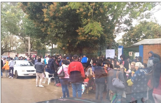
People seeking treatment at the vision clinic in Paraguay

For many years, Diane has volunteered with Vista