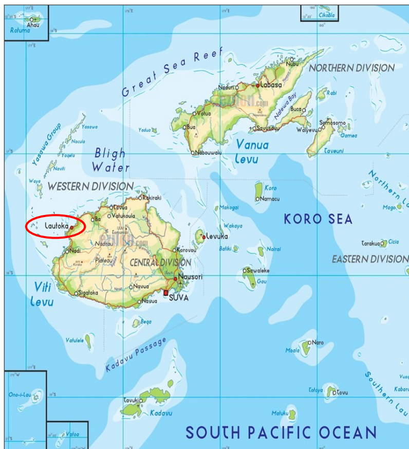
Map of the Fijian Islands. Lautoka is circled in red.

He sums up his philosophy of ministry this way: “Here at CTEF and among Bible Churches, our desire for everyone is that they may learn sooner how it is only when under the exclusive ownership of God, can we give our Master unquestioning obedience . Like a dispensing chemist who makes up a medical prescription prescribed by a doctor, the requirement is to do the job as instructed , and not to try to make self-devised “improvements” of one’s own. Hence, does man indisputably consider us as servants of Christ? ” May we all be so found by those who observe us.