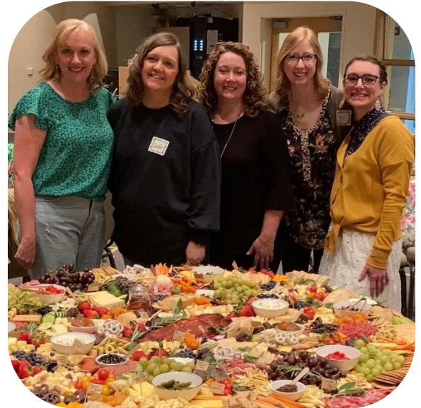
2022 Women's Ministry Team at the Charcuterie and Chit Chat event in April, 2022.

Trust in the Lord – In April, the Charcuterie and Chit Chat event was designed to guide conversation around what it looks like to truly trust the Lord.