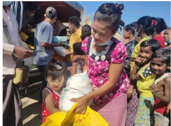
Distribution of bags near SE Asia Bible College